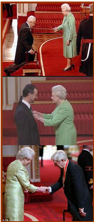
Queen Elizabeth bestowing honours on some of her favourites

In England, on December 31st, the New Year's Honours List is announced. Honours of different types are given out to people in recognition of their services to their country. The most well-known, internationally, may be the knighthood, which allows the recipient to add 'Sir' (or 'Dame' in the case of a woman) to their name. A recent example is Sir Paul McCartney.