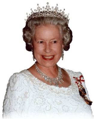
Queen Elizabeth II

The Victoria Cross is the highest military honour for bravery 'in the face of the enemy' (there is an equivalent award for civilians). It is rarely awarded. A recommendation from an officer, supported by three witnesses, is required before a case can be considered. The case of Lloyd Allan Trigg is unique in that his award was granted solely on the basis of evidence supplied by the enemy; there were no surviving witnesses to his bravery from his own side. Though an experienced pilot, Trigg was flying a Liberator, a plane he had never flown before, over the Atlantic in November 1943 when he engaged a German U-boat. His aircraft received several hits from the submarine's anti-aircraft guns and burst into flame but Trigg refused to break off his attack. He dropped his bombs, sinking the submarine, but his plane dived into the sea, killing all on board. Some of the German crew were able to escape using a rubber dinghy which broke free from the Liberator when it crashed and were later picked up by the Royal Navy. The German captain reported the incident and recommended Trigg for an award. He later said, 'Such a gallant fighter as Trigg would have been decorated in Germany with the highest medal or order'.