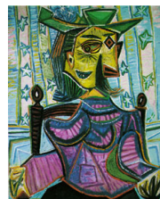
"Dora Maar, Sitting" by Picasso

way, objects could be represented from many angles as if the viewer was moving around them. Thus "time", the fourth dimension, was also being represented on the two-dimensional surface of a painting!