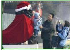
A family takes a photo near a mythical lion dressed in Santa Claus!

In China , Christian children decorate trees with colorful ornaments . These ornaments are made from paper in the shapes of flowers, chains and lanterns . They also hang muslin stockings hoping that "Dun Che Lao Ren", or "Christmas Old Man" (Santa Claus) will fill them with gifts and treats. The Chinese Christmas trees are called "Trees of Light."