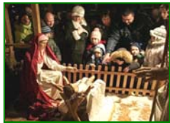
People look at a Nativity scene in Moscow

In Russian , there are special prayers at Christmas and people fast , sometimes for 39 days, until their January 6th Christmas Eve. They then begin a twelve course supper in honor of each of the 12 apostles - fish, beet soup or Borsch, cabbage stuffed with millet , cooked dried fruit and much more. It is not Father Christmas, or "Dedushka Moroz" (Grandfather Christmas), who gives out presents to children, but Babushka. The legend tells us that she declined to go with the wise men to see Jesus because of the cold weather. However, she regretted not going and set off after them to try and catch up, filling her basket with presents. She never found Jesus, and that is why she visits each house, leaving toys for good children.