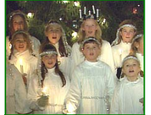
Children sing X'mas carols in church

Julenissen (the Christmas elf ), with his stocking cap and long white beard, brings presents to Norwegian children on Christmas Eve. Families also exchange gifts on Christmas Day. In the past, Norwegian children would dress up in costumes and go from house to house asking for treats, much as North American children do for Halloween. The leader of the group would be dressed as a bukk, or goat, and the custom was known as "going Julebuk" (Christmas goat)." Children in rural areas of Norway still go Julebuk today.