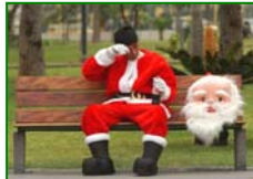
Santa takes a break in a public park in Lima

In Peru , when priests first started to travel, they would carry small altars around with them to festivals. These alters gradually developed into portable boxes with saints above an altar and scenes from everyday life below it. Now-a-days , they are more likely to depict Mary, Joseph and the baby Jesus in scenes attended by local people.