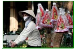
A vendor in a Hanoi city street selling Santa hats

Christmas is one of the four most important festivals in Vietnam ; the others being the birthday of Buddha, the New Year and the mid-autumn festival. It was introduced during the period of French rule. On Christmas Eve, Vietnamese Christians attend a midnight Mass. After Church they return to their homes for a Christmas supper. The dinner usually consists of chicken soup, the more wealthy enjoying turkey and Christmas Pudding.