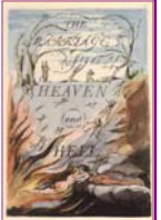
"Le Mariage du Ciel et de l'Enfer" de William Blake

Every year in July we set up a stall in Okaido, just outside of Crossroads, during the Summer Street-Market Festival. This year we want to invite our student to join in by making use of this space to display your own handy-crafts, other items of interest or ideas - Are you in a flower arranging class? Do you paint? Make clothes or other items?