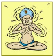
Mandirun practicing yoga

So, the lesson from this story is: Make sure your disciples are ready to hear words of wisdom before you serve them tea in your best china!