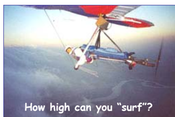
How high can you "surf"?

In September and October, spring in the southern hemisphere, a spectacular phenomenon occurs over Burketown and the adjoining areas. It's called the "Morning Glory". At this time of the year, sea breezes blow inland from both sides of Cape York. When these collide along the centre of the Cape, single giant clouds are formed. Powerful, fast moving "waves" can suddenly appear in the otherwise blue sky. They roll across the Gulf and over the adjacent land.