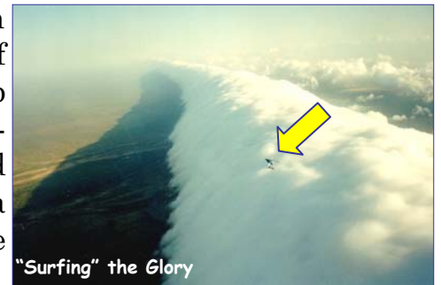
"Surfing" the Glory

In spring, every year since 1989 when the first Glory was ridden, Burketown becomes quite an international centre as cloud-surfers from around the world gather to test their skills, and nerve, on the Glory. So, if you can, grab your hang-glider and head off to Australia now while the "SURF'S UP"!