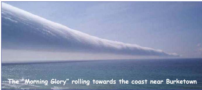
The "Morning Glory" rolling towards the coast near Burketown

When surf and big waves come to mind, most surfing enthusiasts think of Waimea Bay, Maverick's, Cortes Bank and Noosa, but, Burketown? Nobody has heard of Burketown, let alone associate it with surfing!