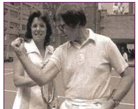
Billie Jean and Bobby Riggs

King: “Any time you're satisfied with mediocrity, any time you take away incentive from human beings, you've blown it. I'm a perfectionist... . Any woman who wants to achieve anything has to be aggressive and tough, but the press never sees us as multidimensional.”